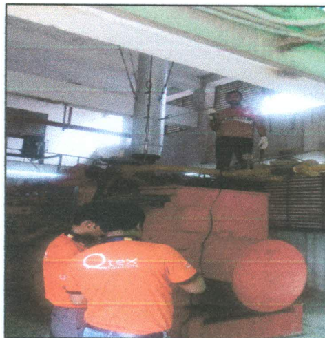
Fig: Generator ((5283701689(G-02))